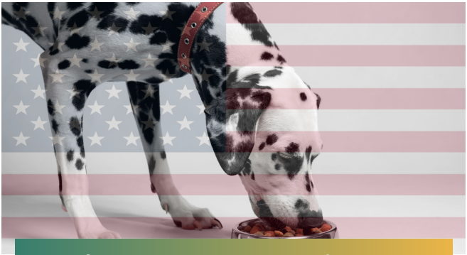
FeedNavigator - AAFCO authorization

Dive into the latest updates and highlights of our partners' successes, as well as new opportunities for advancements in the Farmÿng project.